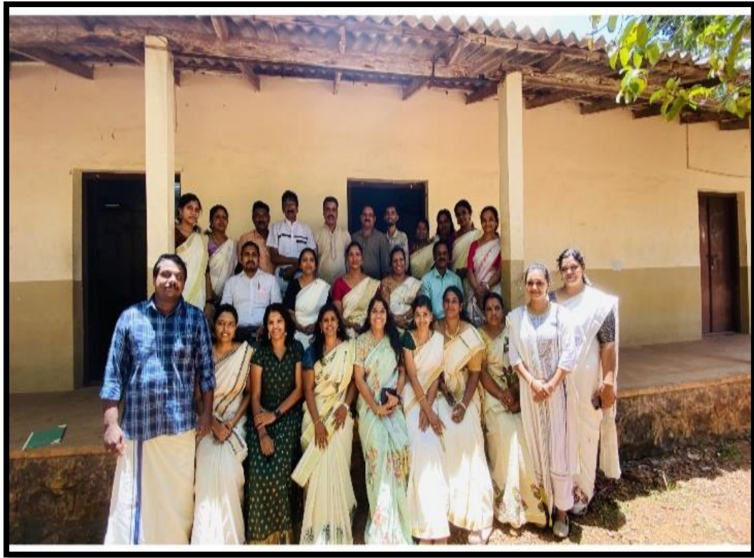
Onam photo –Staffs