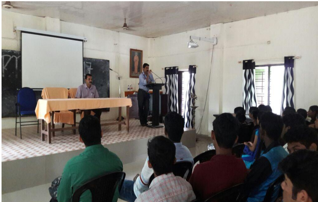
Awareness class by Deputy Tahasildar of Chengannur taluk

have completed 18 years voluntarily came forward to enrol their names in electoral roll. The programme concluded with vote of thanks .