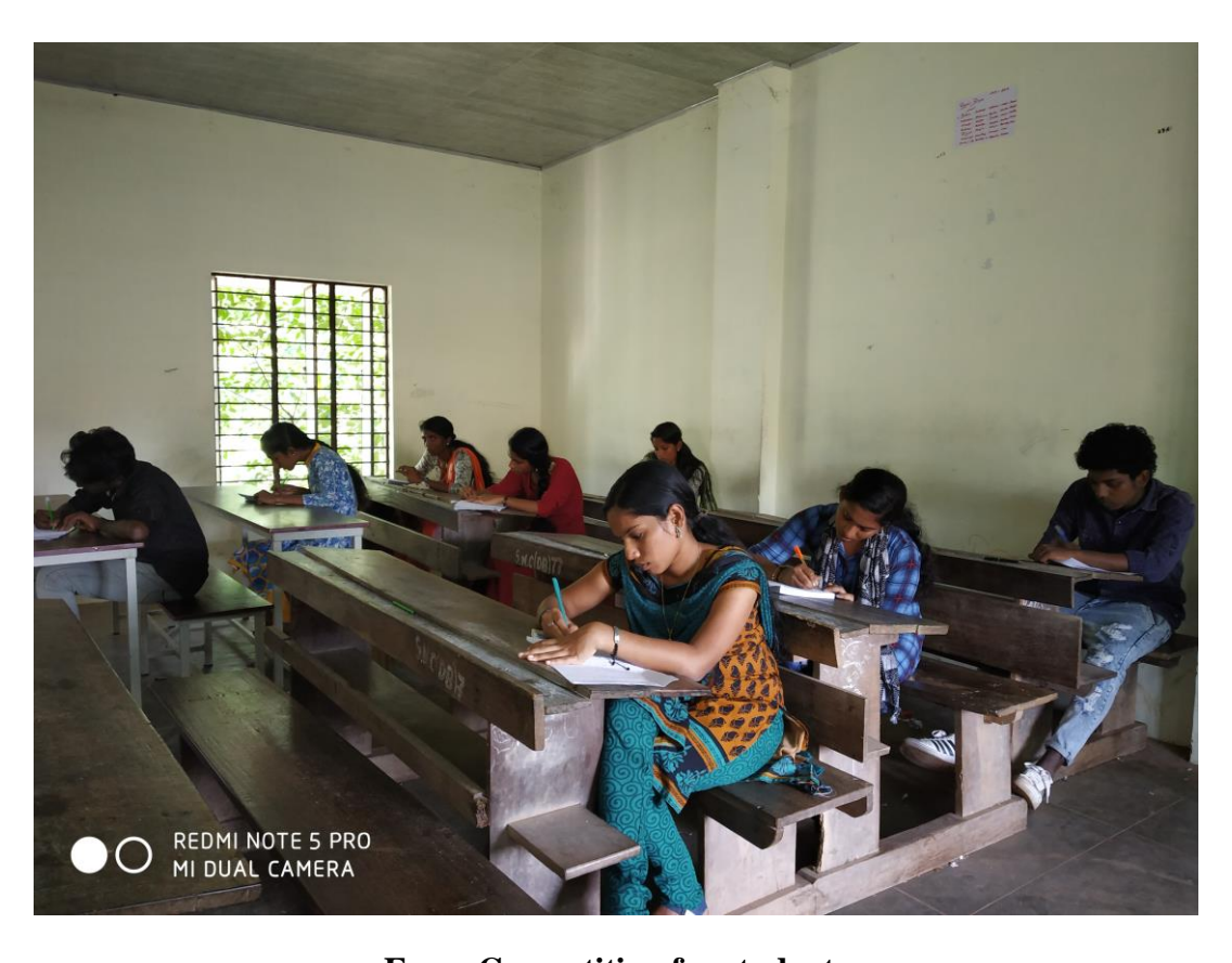
Essay Competition for students