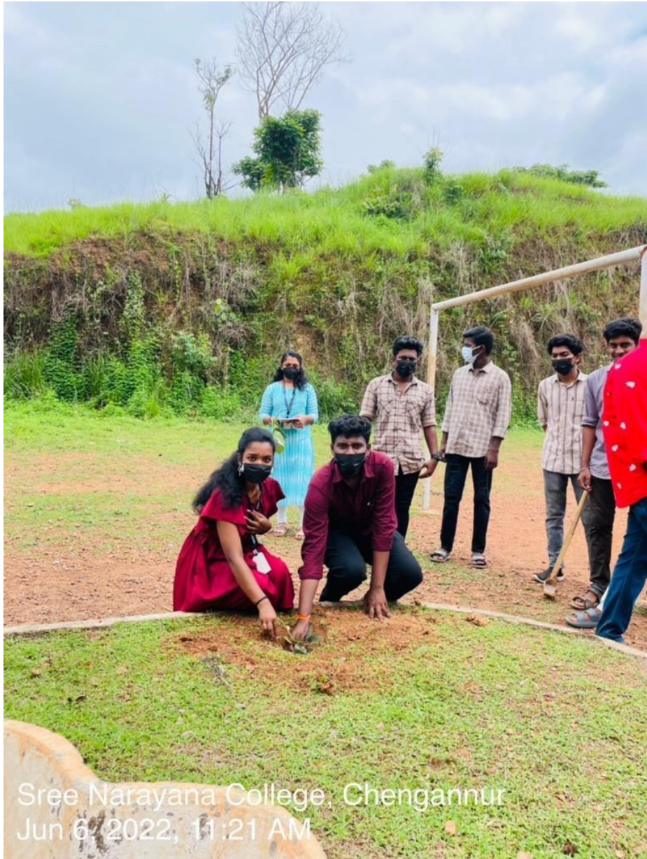
Active Participation – Students