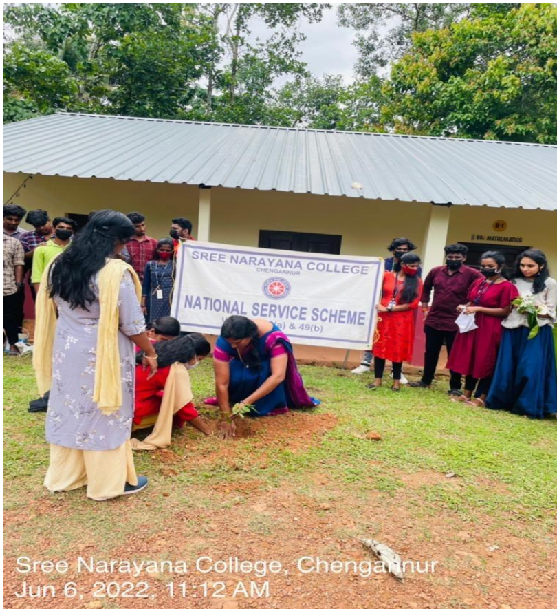
Active participation – Staff