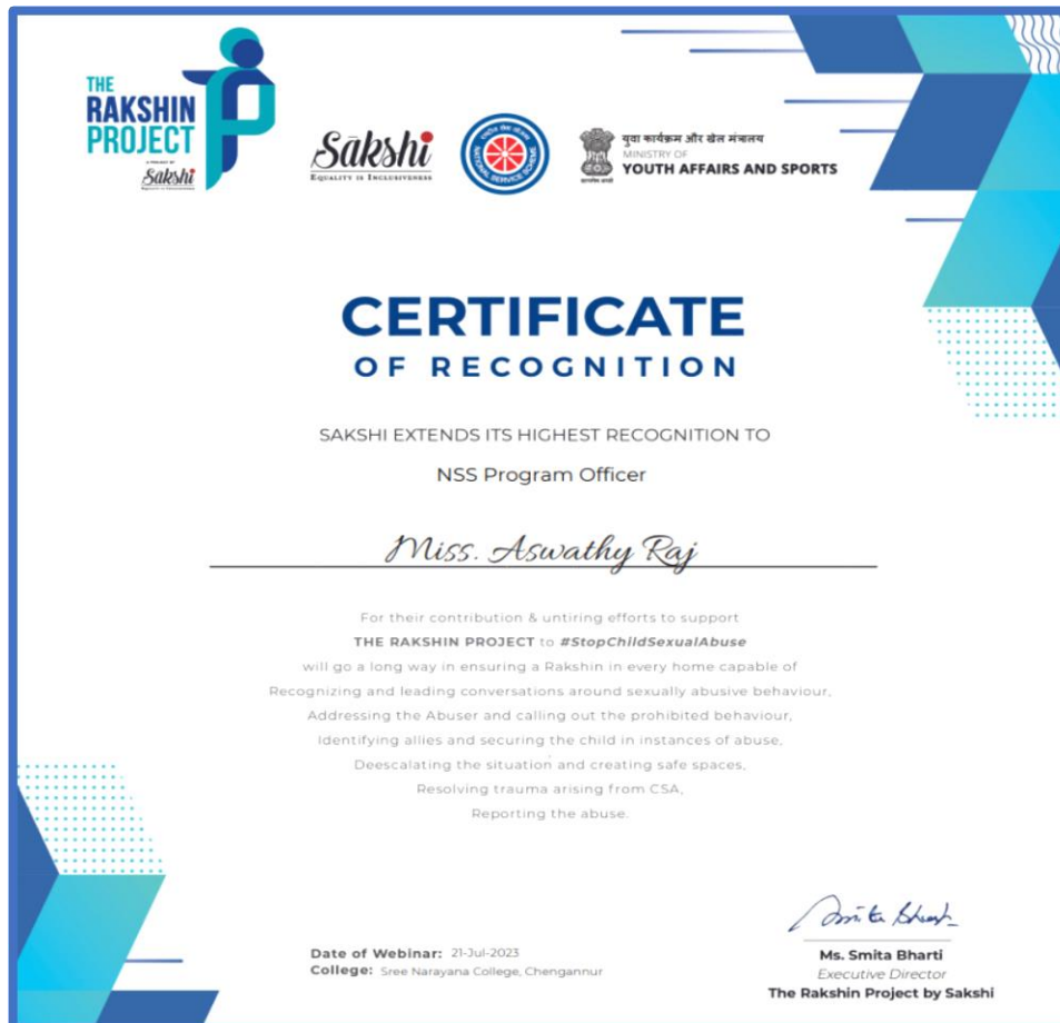
Certificate of Recognition for NSS Programme Officer