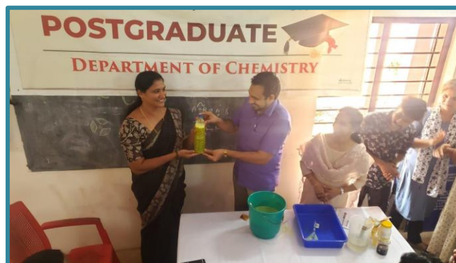
Distribution of dish wash liquid