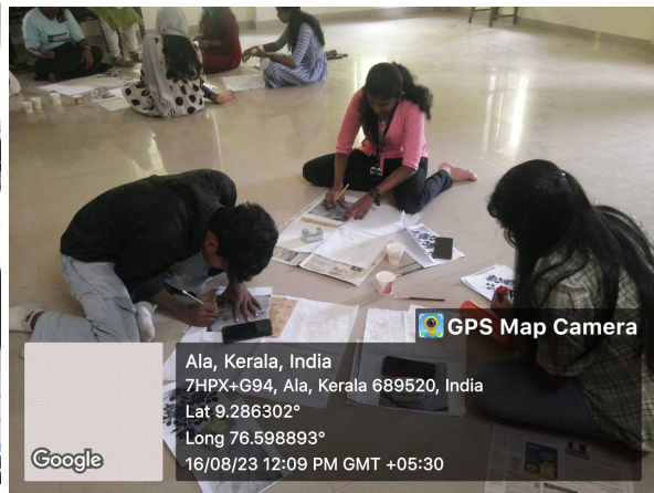
Participants at the workshop