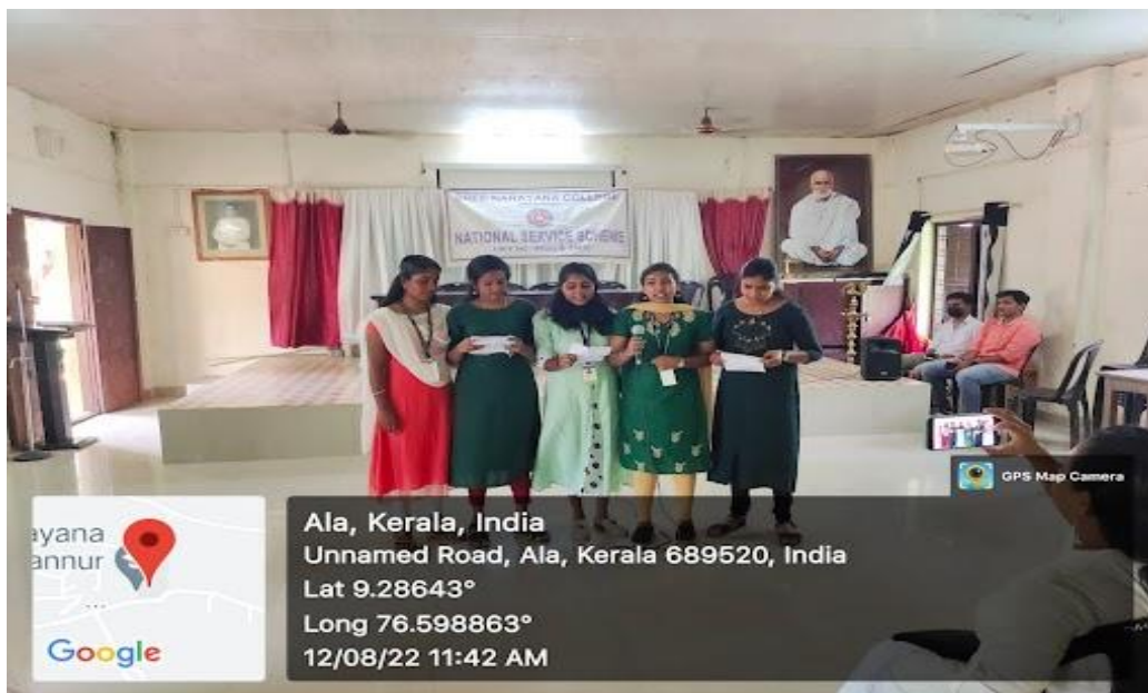
Team NSS with principal