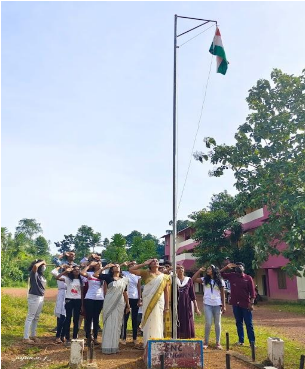
Saluting the National Flag

India. The flag hoisting inculcates a sense of victory and pride among countrymen