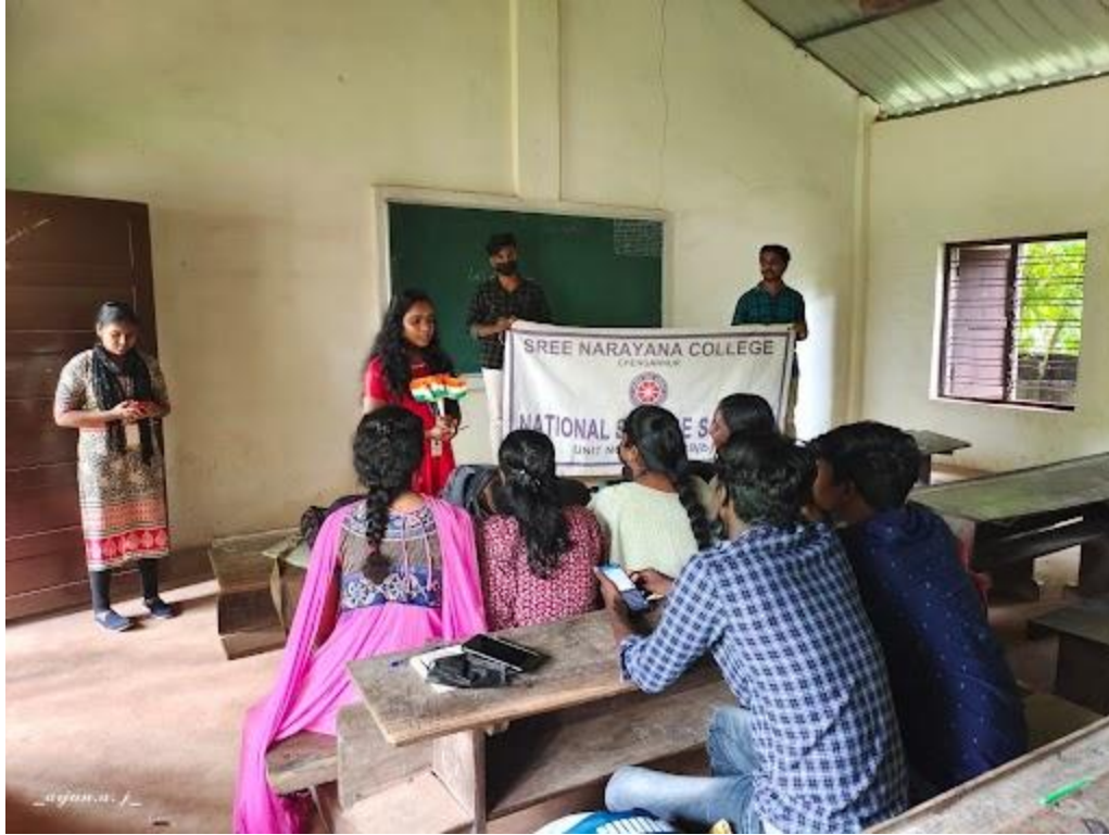
Tiranga Campaign in classes