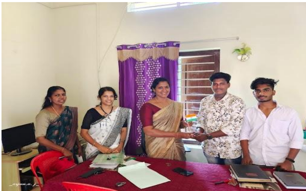
Handing over the tricolor to the Principal