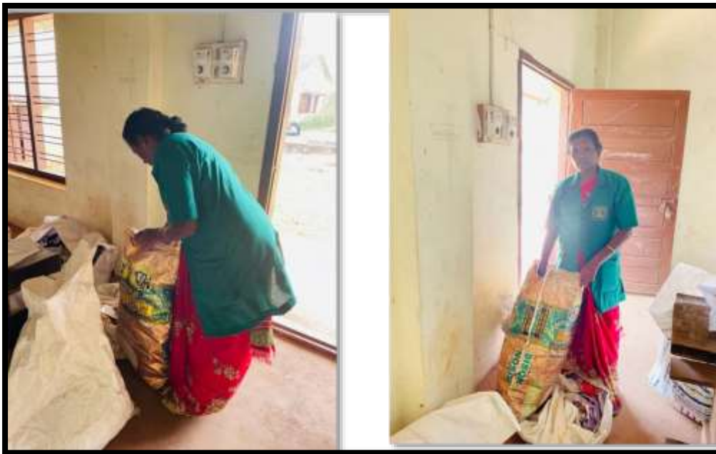
Collection of Plastic waste by Haritha Karma Sena