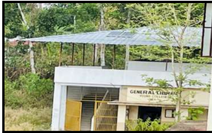
Solar Panel installed at the college