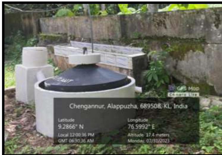
Biogas Plant at the Campus