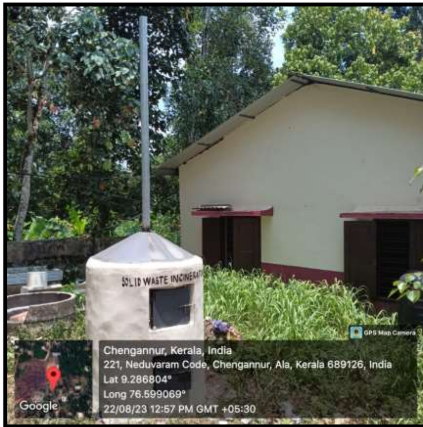
Solid Waste Incinerator installed at the campus