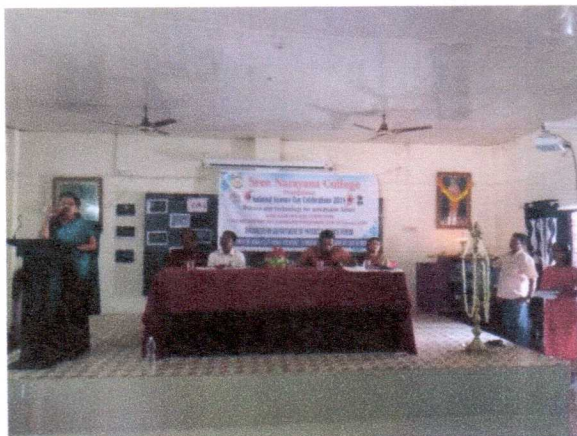
Presidential address Principal