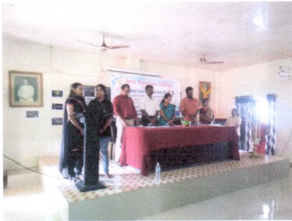
Prayer song by the college choir