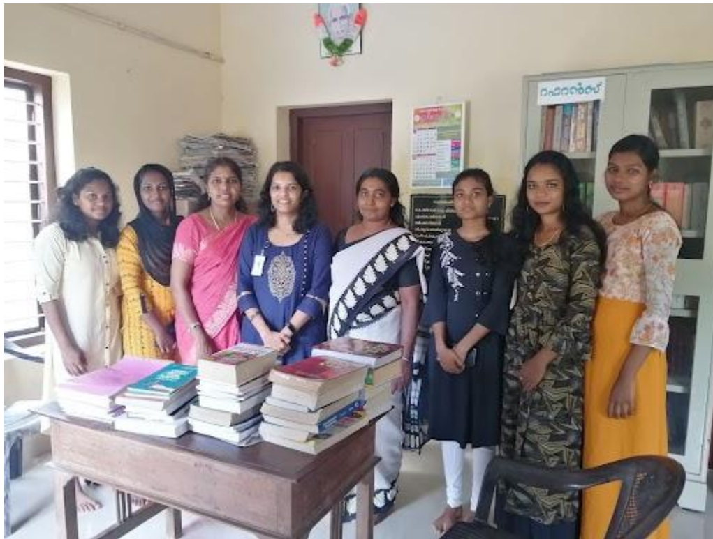
Collected books handed over to the librarian, People's library