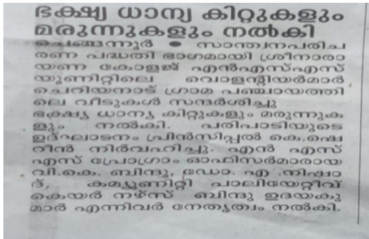
News Published in the news paper regarding SN College Chengannur NSS Volunteers