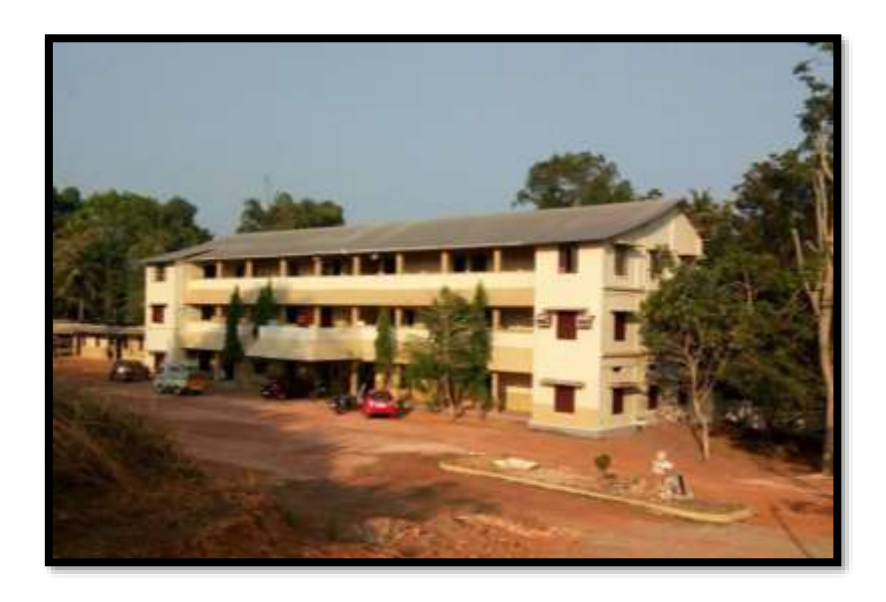
Sree Narayana College campus before No-Vehicle Day