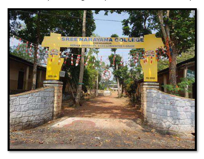
Sree Narayana College campus on No-Vehicle Day