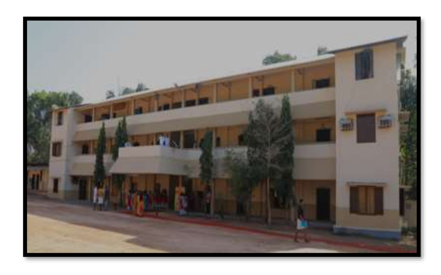
Sree Narayana College campus on No-Vehicle Day