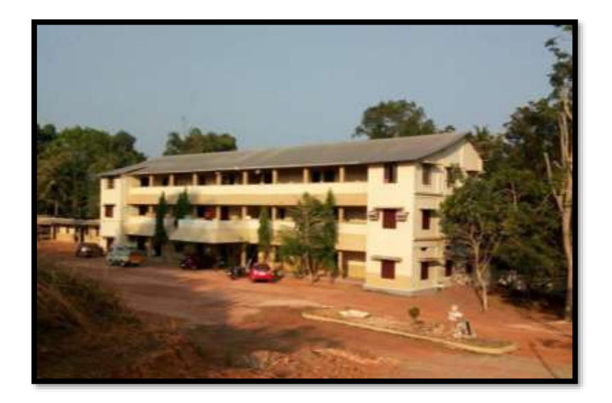
Sree Narayana College campus before No-Vehicle Day