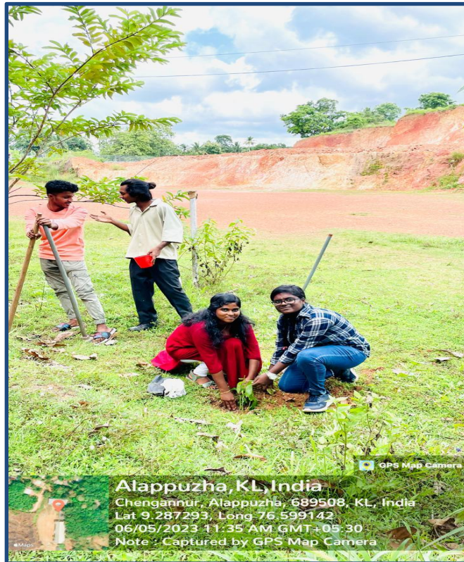
NSS Volunteers Active Participation – WED 2023