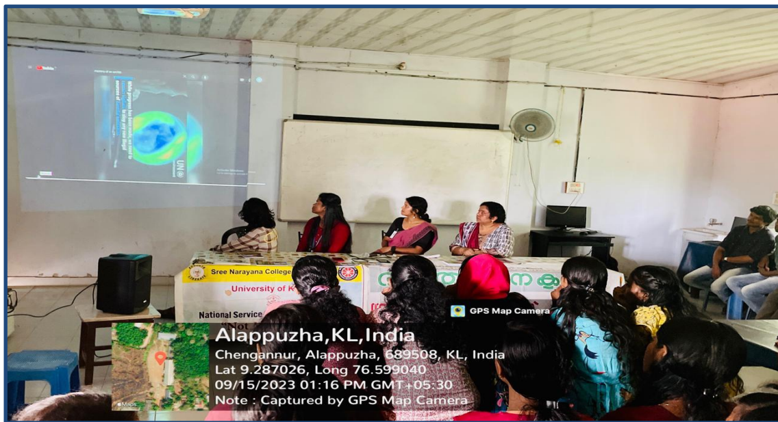
Short Video Presentation on World Ozone Day