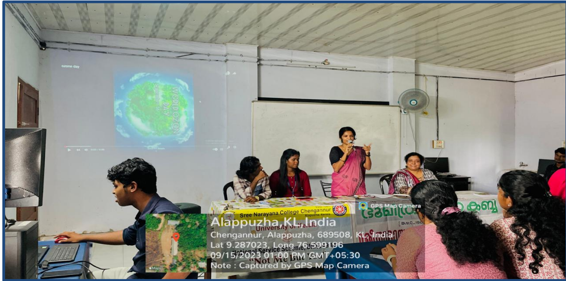
Documentary Show on Ozone Depletion