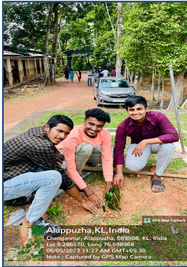
BMC Members Active Participation – WED 2023