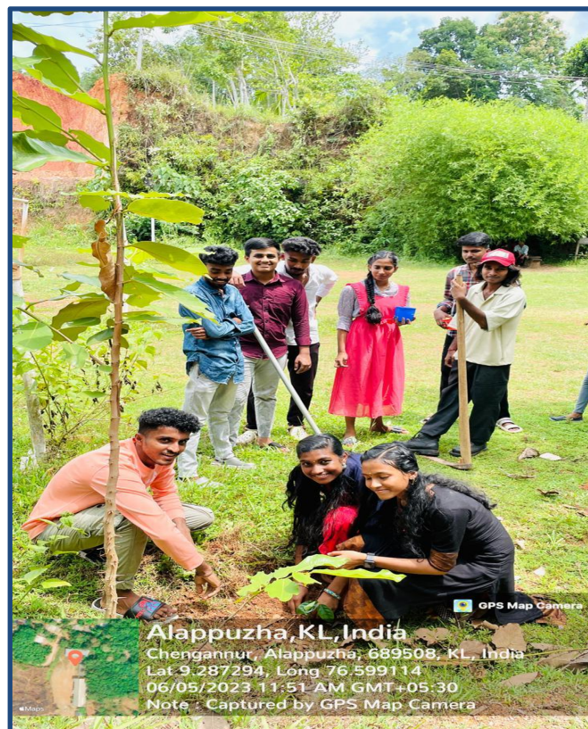
Planting Fruit Bearing Tree Saplings in the campus premises