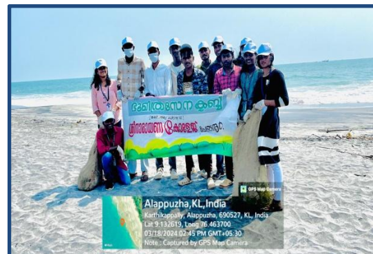
Beach Cleaning Drive