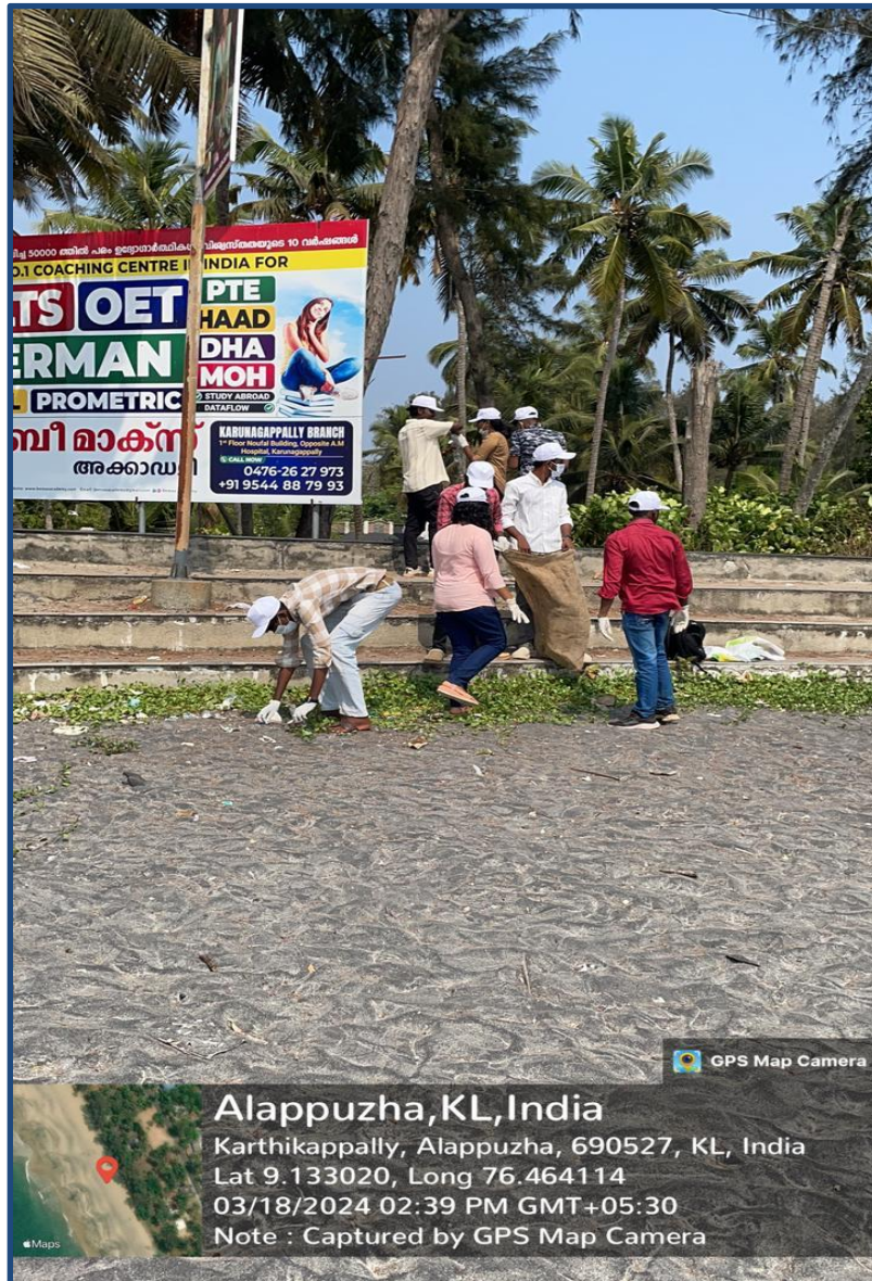
Beach Cleaning Drive – Azheekal Beach