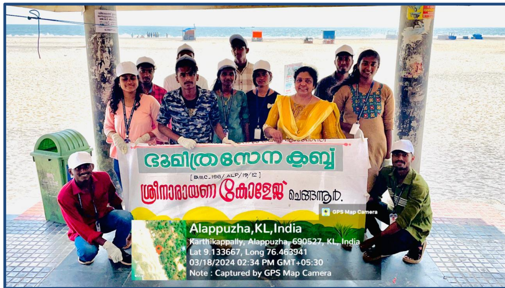
Beach Cleaning Drive

equipped with all the necessary cleaning tools like gloves, rakes and sacks. Masks and caps were worn throughout the cleaning activity and sanitizers were provided to them. After a two-hour vigorous clean-up our students collected the litter comprised of Plastic Bottles, Plastic Food Wrappers, Plastic Spoons, Plastic Covers, Clothes, Paper, Rubber, Glass etc. The Collected Beach Litters were sorted and properly disposed at the site from where Haritha Karma Sena collects to shredding units for recycling.