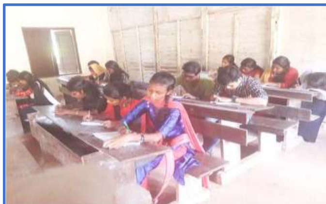
Impulsive Essay Writing Competition Prize Distribution