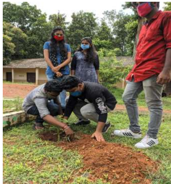
WED – 2020 : Active participation