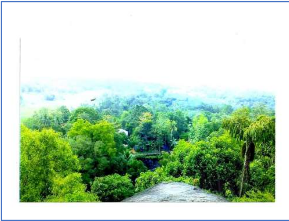
1 st Prize