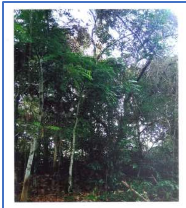
II nd Prize