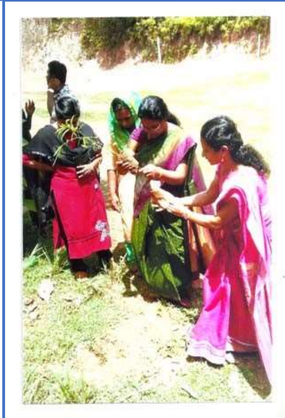
Save the earth: Plant a tree