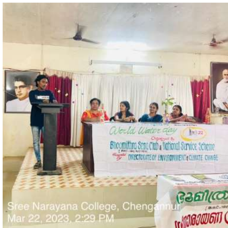
World Water Day Celebration – Announcement of Winners