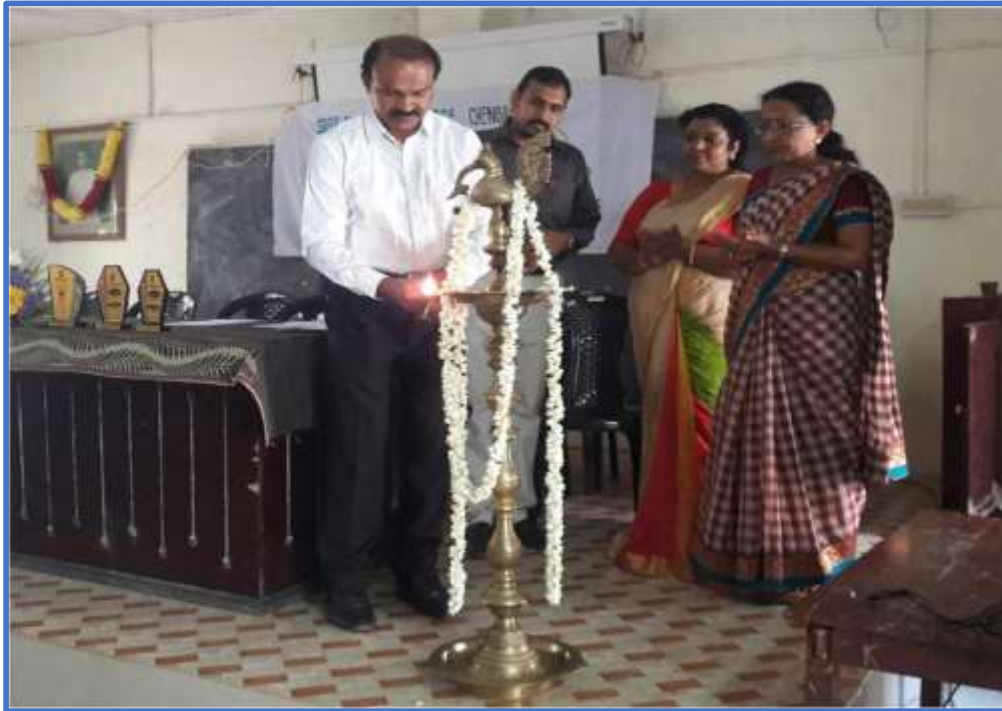
Inauguration and Inaugural speech