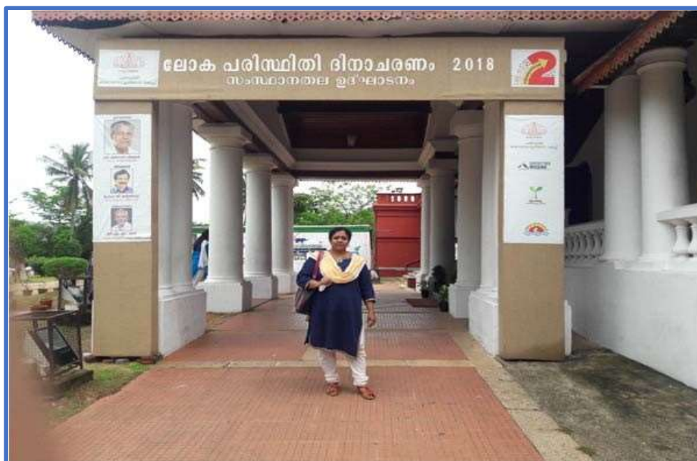
FIC of B M C