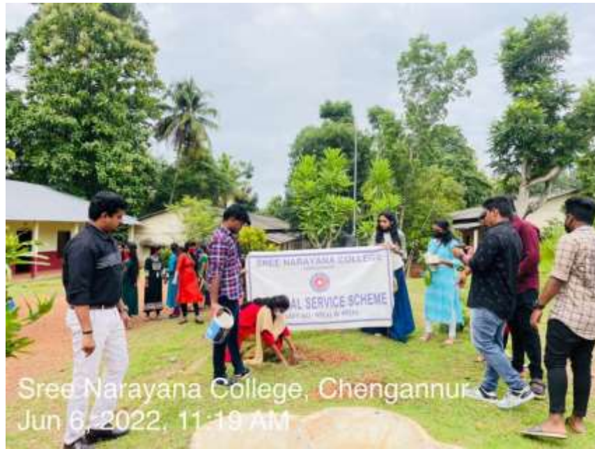
Planting Saplings by NSS Programme Officers