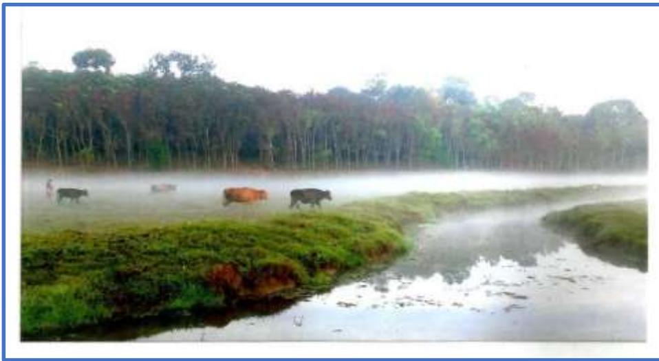
1 st Prize