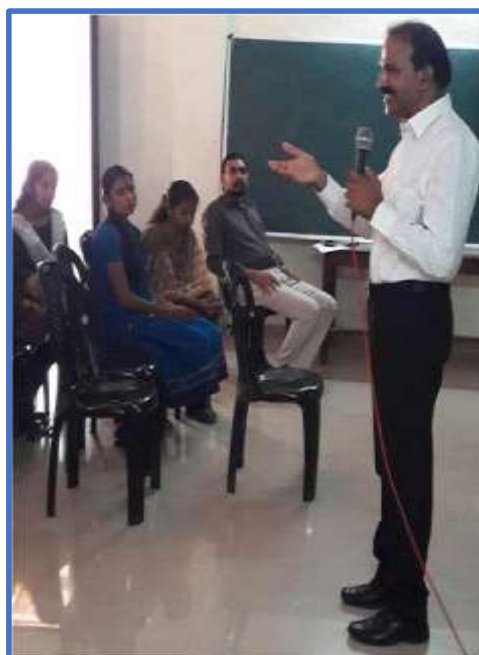
Class on “Water for Sustainable Development”