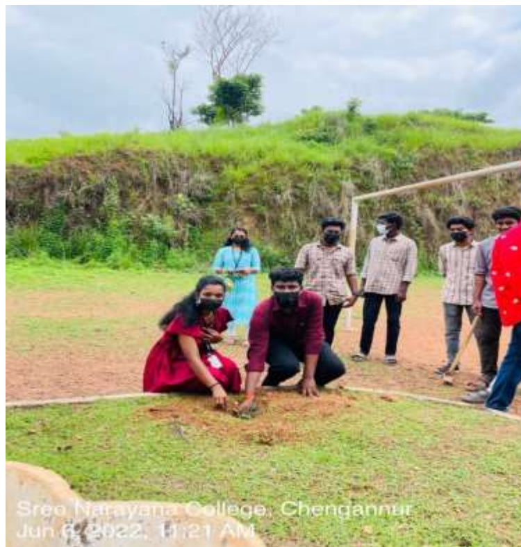
WED – 2022 : Active participation by BMC Members