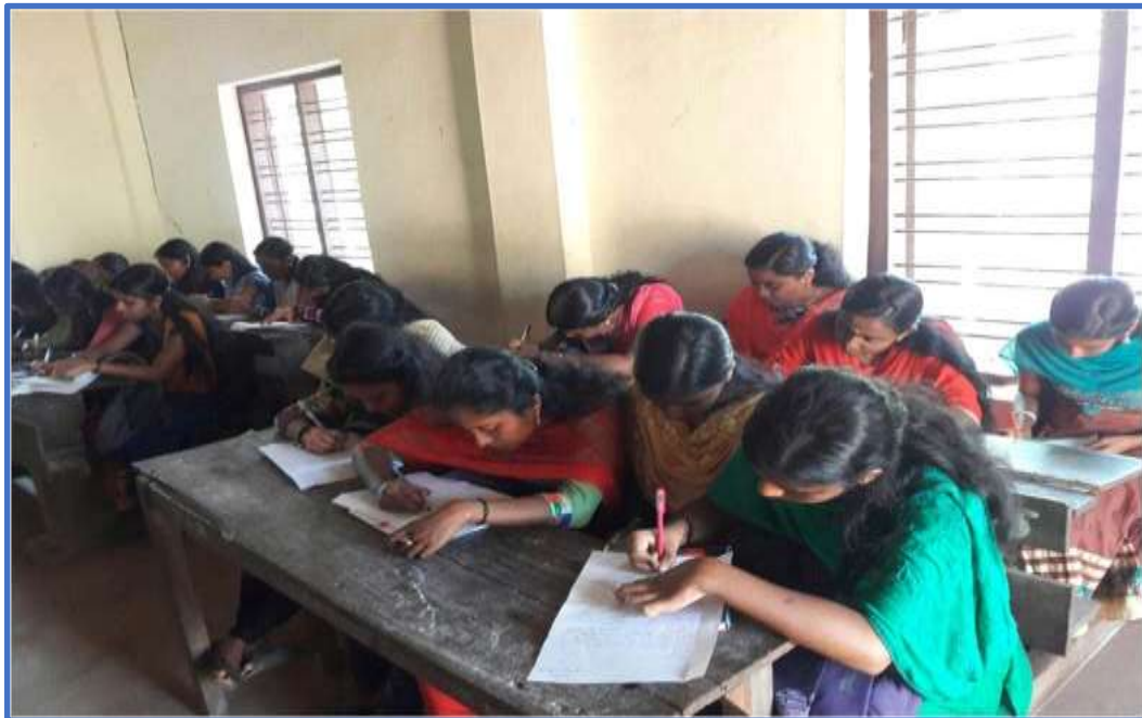
Impulsive Essay Writing Competition