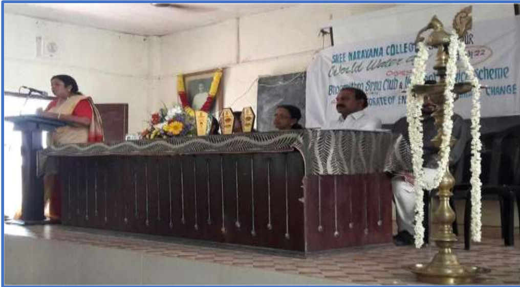
Welcome speech by FIC, Bhoomithra Sena Club