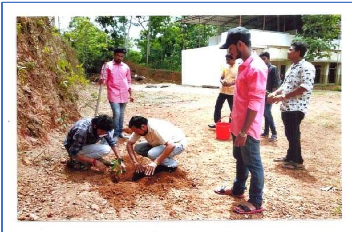
WED - 2019: Active participation