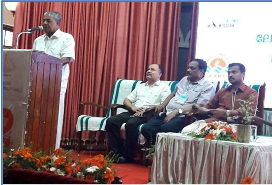
Inaugural address by our Hon: Chief Minister