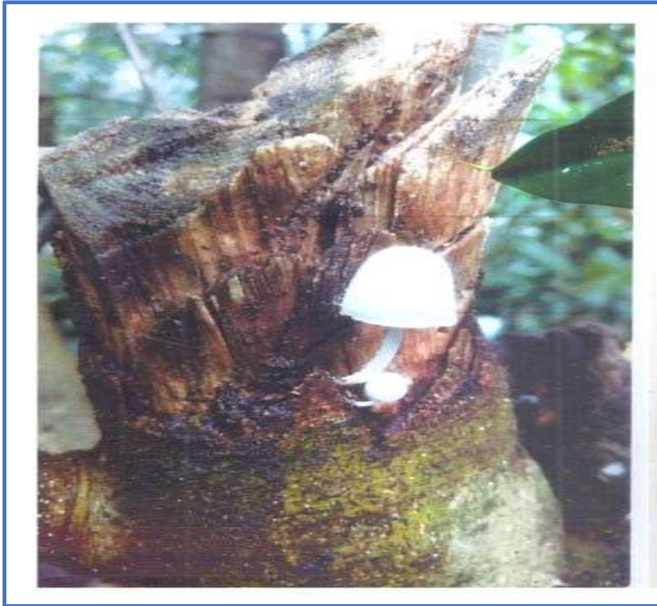
II nd Prize