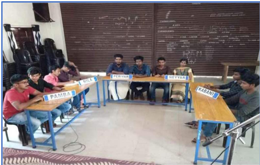
'Nature Quiz' Competition