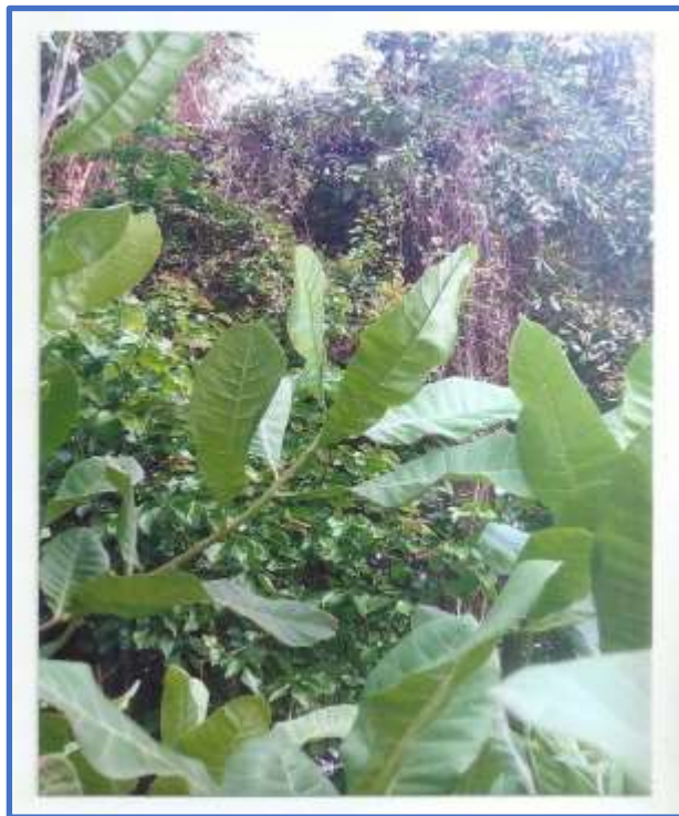
III rd Prize