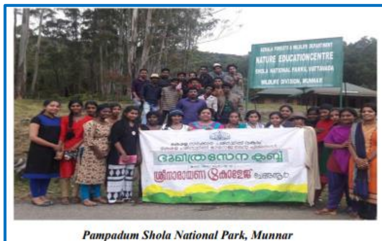
Pampadum Shola National Park, Munnar