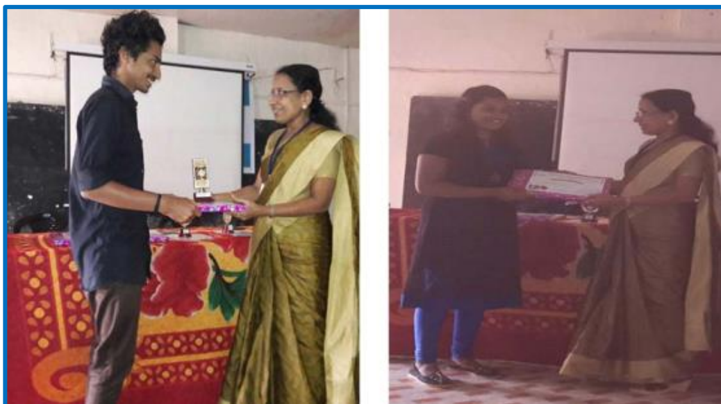
Prize distribution to winners

The Bhoomithra Sena Club in association with NSS of Sree Narayana College, Chengannur organized an essay competition and painting competition on the topic “Save Ozone, Save Life”. The students actively participated in the competitions and programme was a great success.