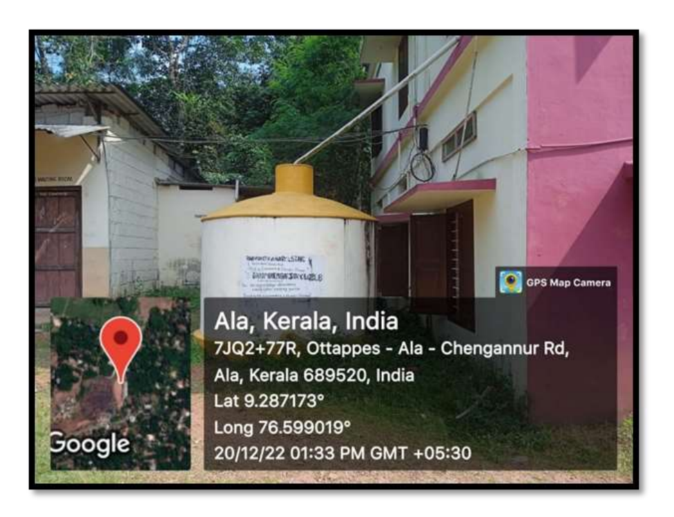
Rainwater Harvesting System