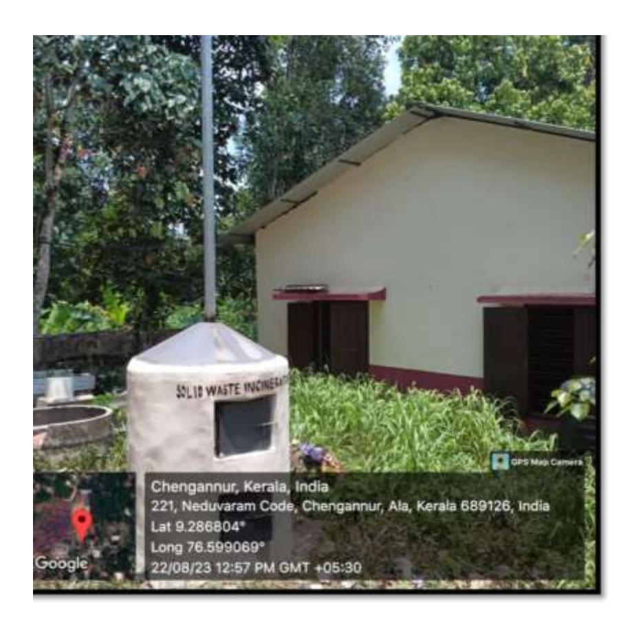
Solid Waste Incinerator