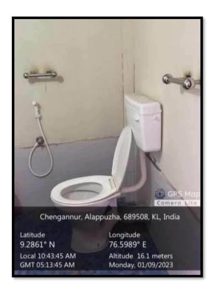
Disabled Friendly Toilet